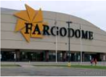
The pinnacle and culminating event for summer wrestling is the Greco-Roman and Freestyle National Championships held at the Fargodome in Fargo, North Dakota

It is a more than a repeated cliché in the wrestling circles throughout the country. It is the path that some choose for their spring and summer activities. The "boys of summer" usually refers to those that dawn the ball caps and cleats on the diamond; however, some wrestlers have aspirations of earning the coveted USA Wrestling - All American status in the traditional Folkstyle or in the international styles of Greco-Roman or Freestyle competition.