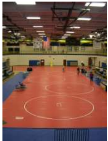
River Falls High School Wrestling Mats

Make a point to get to a few tournaments this season.